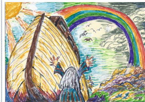
Illustration by Tony Hulse

NEIGHBOURHOOD ‘WATCH & PRAY’ Mon 30 th Apr, 14 th & 28 th May 5.30-6.15pm 3 Testwood Road