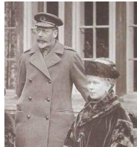
King George V (1910-1936) and Queen Mary

IN THE last hundred years Britain has seen 24 Prime Ministers, 5 monarchs, 2 world wars, the formation of the NHS, major advances in medicine and the invention of the radio, television, mobiles and the internet, to name but a few. The world then and the world now are very different places.