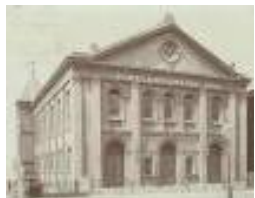
Portland Baptist about 1905

And, on the corner of Testwood Road and Waterhouse Lane, a church was planted in 1911 to be that salt and light, to stand against the changes of time with the timeless message of Christ.