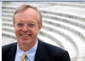
General Secretary – Baptist Union of Great Britain

WHEN I was called to be General Secretary five years ago I made it clear that prayer would be my priority. Nothing has changed. I still see prayer as the absolute priority for our denomination.